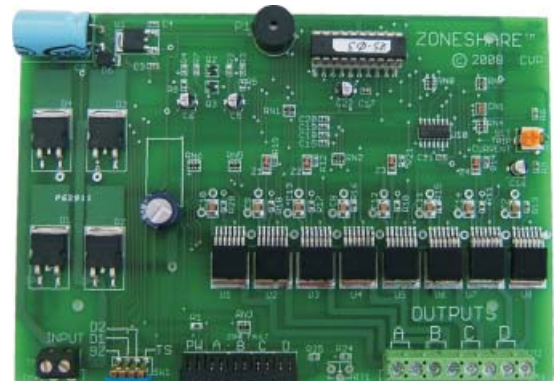
ZoneShare Model ZS4X

ZS4E..... ZoneShare Deluxe Mounted In Case ..... $179.95